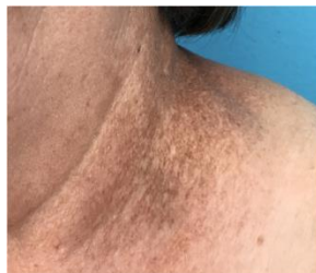
Figure 1(b): Dyschromic macules on lateral aspect of the neck.