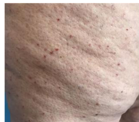
Figure 1(c): Pruritic papules on the anterior aspects of the left thigh.