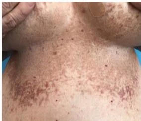
Figure 1(a): Mottled hyperpigmentation with peripheral scaly erythematous papules on the trunk and Inguinal folds.

The proband had no parents and siblings alive. She had three daughters-the elder born in 1974, and twins born in 1979. Since ten years the elder daughter had a few hyperpigmented macules on the neck. One of the twins, presented with localized hyperpigmented mottled patches in both axillar folds, started 3-4 years ago. Both patients denied subjective symptoms. Exacerbations occurred rarely, only in extremely hot weather and on friction. They tolerated their skin changes well and did not use any therapy. The third daughter was clinically unaffected.