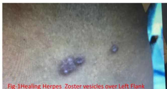
Figure 1: photo showing left flank abdominal bulge with the eruption of HZ

A 60-year-old male presented with a left lumbar abdominal wall protrusion in the surgery OPD department. He gave a history of Diabetes Mellitus. Eighteen days earlier, the patient had a painful skin rash without any prodromic symptoms. There was a history of skin vesicles and pustules' rapid eruption over the left T11-T12 dermatomes area. The patient was diagnosed with HZ and abdominal wall protrusion (Figure 1). There was no history of antiviral therapy was, and the shingles started fading. There was a history of the sudden appearance of a bulge in the left lumbar region. The bulge was painless, compressible, without any sensory deficit. It got prominent with the Valsalva maneuver.