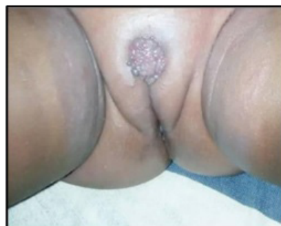
Figure 2: Week 1 Sept 27