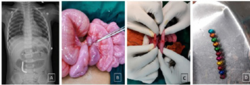
Figure 1: Infant with multiple magnet ingestion

The post-operative period was uneventful, oral feeds were started on post-operative day 3 which was progressed to full feeds by day 6. The infant was discharged from the hospital on post-operative day 7. The stoma reversal was performed 3 weeks later, which was also uneventful. The child at follow up has grown well with no residual abdominal complaints.