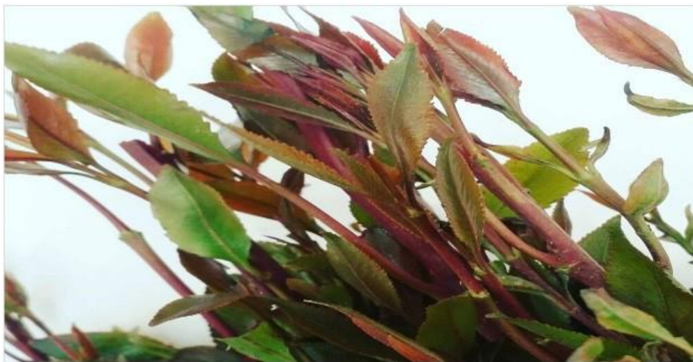
Figure 1: Leaf of khat

Widespread use of khat, especially its concurrent use with tobacco, remains a public health challenge in many countries including Asia, Europe, Australia, and the United States [28]