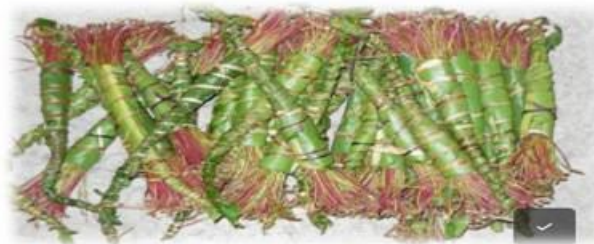
Figure 2: Bundle of khat. The usual length of a bundle is 30–40 cm