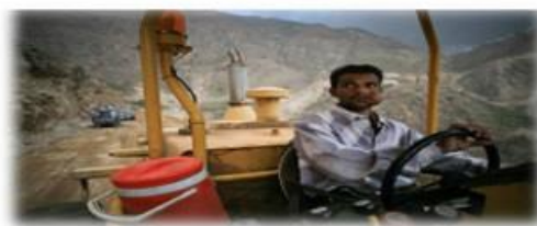
Figure 3: Exemplary of Khat chewed into a ball