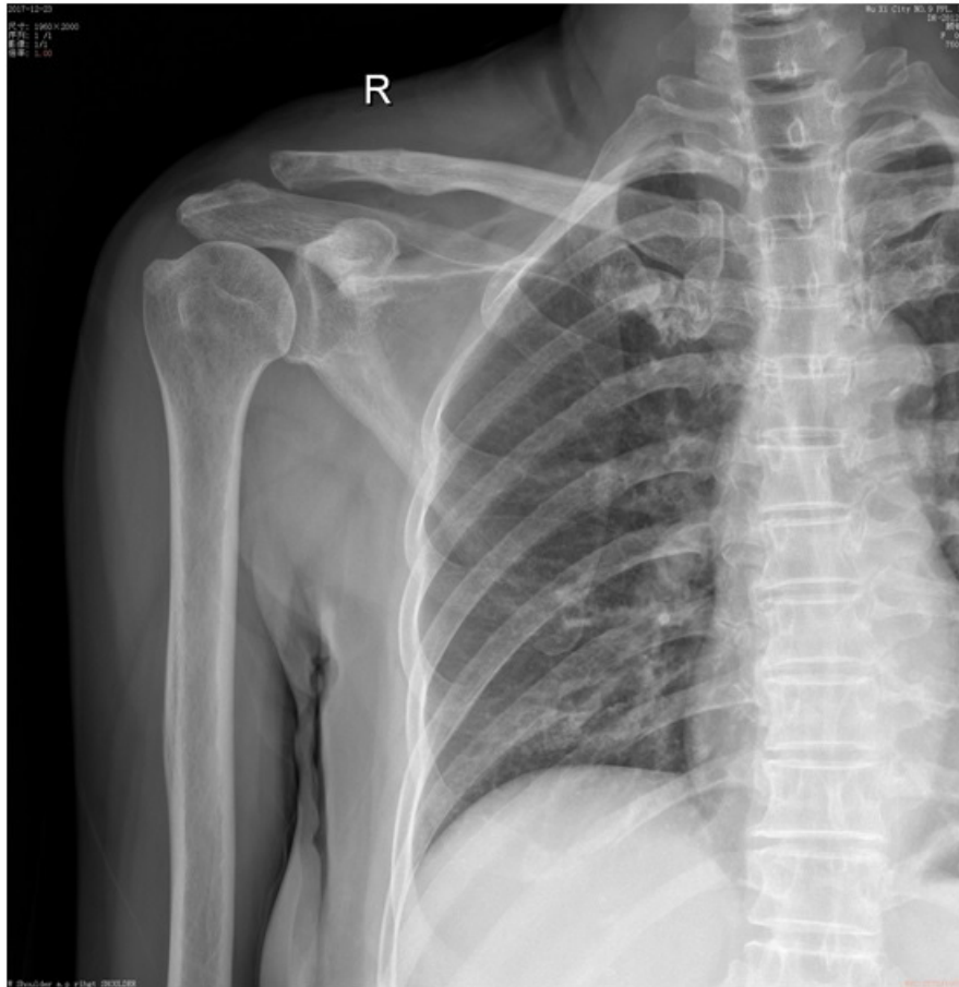
Figure 4: Removal of internal fixation device 6 months after surgery, and no second AC dislocation was seen.

13 patients, including internal fixation failure, a second AC dislocation (Fig.4) or coracoclavicular ligament calcification.