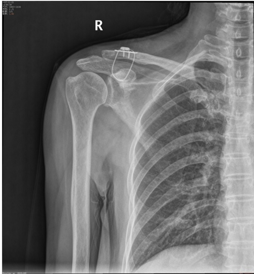
Figure 3: A X-ray in AP view showing a right shoulder in which MSTC combined with AO metacarpal plate was performed.