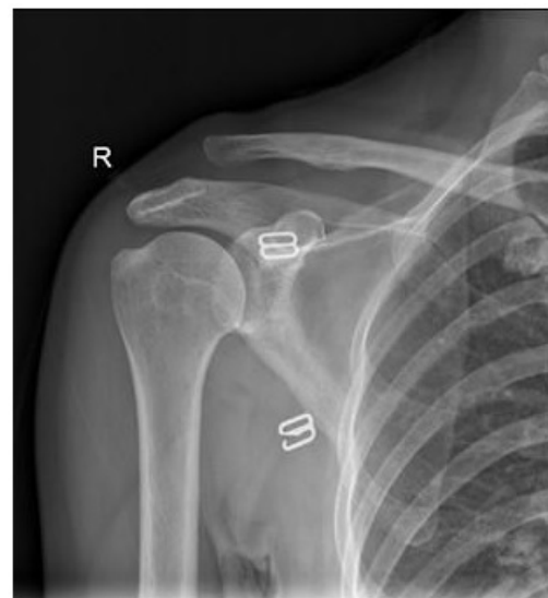
Figure 1: A X-ray in anteroposterior view of a right shoulder with an ACJ injury Rockwood Grade III.

A 65-year-old women was knocked down by a motorbike 2 h ago, and her right shoulder touched the ground, which led to right shoulder pain and swelling. The patient thus visited the Orthopedics Emergency in our hospital. Physical examination: obvious AC joint tenderness, "key sign" positive, limitation of range (LOM) of right shoulder joint, no paresthesia in right hand and right forearm, right radial arterial pulsation was palpable, and favorable blood circulation was seen in right upper extremity. Right shoulder joint X-ray films revealed right AC dislocation, with the AC joint space of about 9 mm (Fig.1). The patient was given preoperative detumescence (mannitol, 100 ml, intravenous infusion, once/day) and analgesia (celecoxib, 0.2 g, oral administration, once/day) symptomatic treatment. The patient was diagnosed with right AC dislocation (Rockwood III) and was proposed to undergo MSTC combined with AO metacarpal plate treatment.