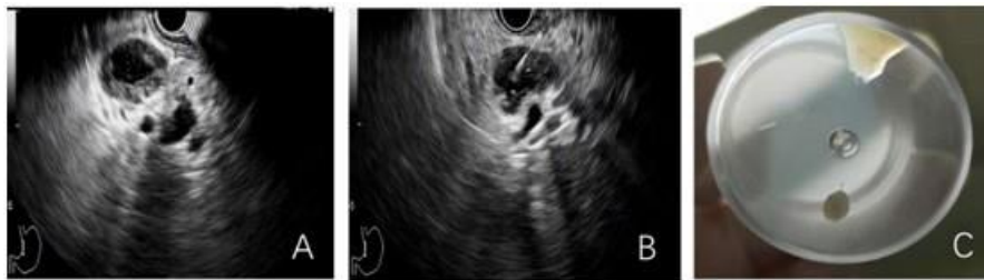
Figure 3: Endoscopic ultrasonography and fine needle aspiration (EUS-FNA) of the enlarged and necrotic lymph nodes.

EUS demonstrated abdominal enlarged lymph nodes with central liquefactive necrosis (A). Fine needle aspiration was performed and 2ml of purulent fluid was acquired (B and C).