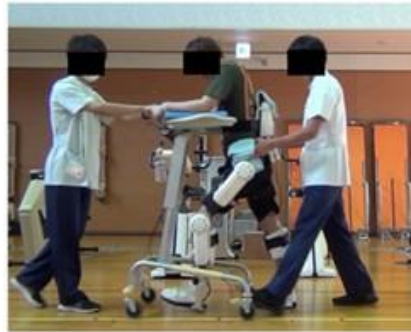
Figure 1b: The contents of the HAL training were as follows: each session lasted 45 min; 15 min for equipping the HAL, 25 min of walking training (6 min of walking in the training room and 3 min of rest, each set repeated thrice), and 5 min for HAL removal. During the training, a doctor was present in case of an emergency, the patient used a wheeled walker to prevent falls, and the patient was accompanied by two physiotherapists.