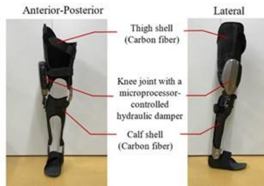
Figure 2: C-Brace consists of a carbon fiber thigh/lower leg shell made for each patient and a uniaxial knee joint with a computer-controlled hydraulic damper connected to it.

10MWT: 10-meter walk test CWS: comfortable walking speed MWS: maximum walking speed 6MD: 6- minute walking distance BBS: Berg balance scale ABC scale: Activate-Balance Confidence Scale